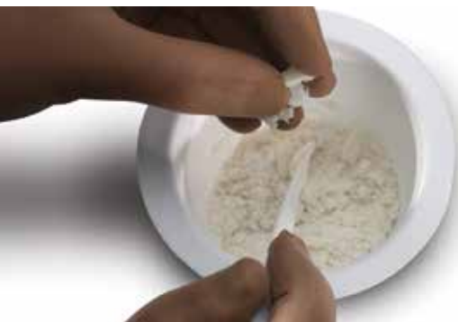
Control Cancellous Content. Dial-in Desired Structural Consistency.