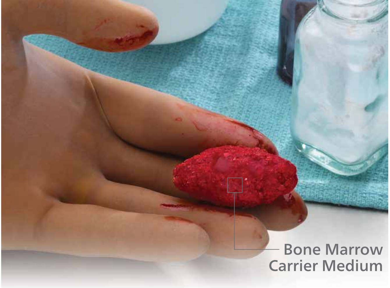
Bone Marrow Carrier Medium