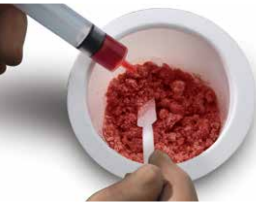
Bone Marrow Aspirate. Add Osteogenic Potential. (Optional)